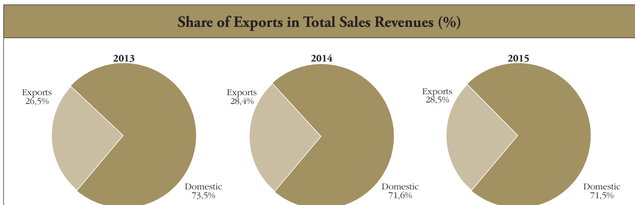
Share of Exports in Total Sales Revenues (%)

In 2015, exports constituted 28.5 percent of total sales revenue of ISO Top 500 enterprises, up from 26.5 percent and 28.4 percent in 2013 and 2014, respectively.